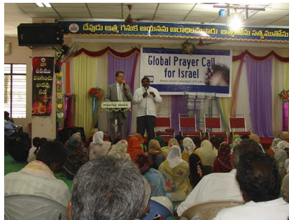
Pastors-Conference in India

By now we have three major events behind us, which have helped us very much, to further clarify the vision and to start the process of implementation: a) Our strategy meetings in Jerusalem, April 21-23 and b) a leadership conference of Christians for Israel International in the Philippines with leaders from 7 Asian nations, where the GPC could be introduced and prayed for, c) and two Pastors-Conferences on the Global Prayer Call in Hyderabad, India. With those three very helpful and productive events, the Masterplan for the Global Prayer Call has sharpened. Here are the key components: