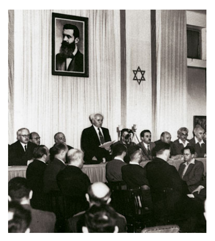
David Ben-Gurion (First Prime Minister of Israel) publicly pronouncing the Declaration of the State of Israel

In the three years in between 2015 and 2018, you have a number of other dates which seem to carry some kind of prophetic significance in light of biblical patterns of "times and seasons" : 40 years of one of the most dev-